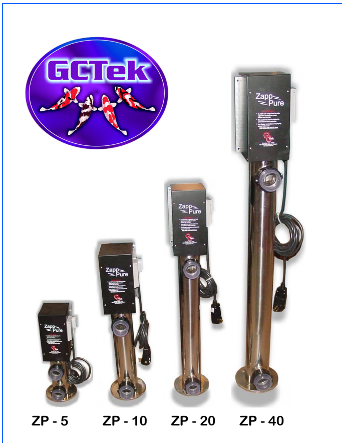
ZP - 5